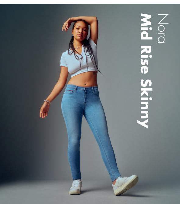
Nora Mid Rise Skinny