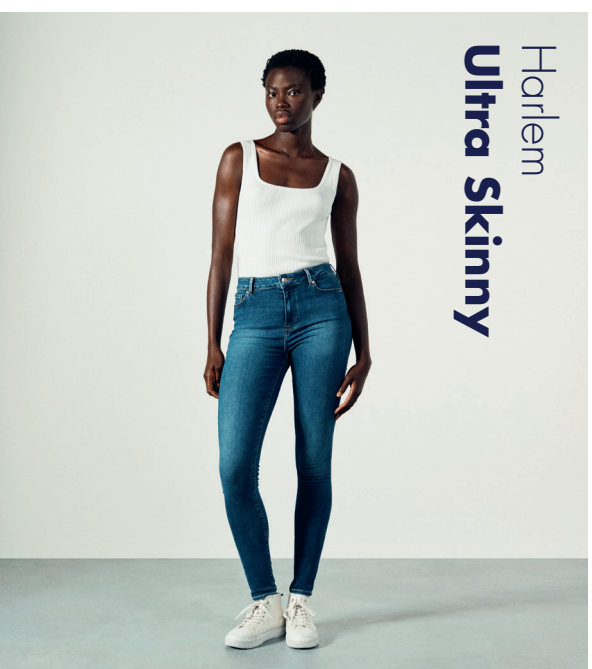
Harlem Ultra Skinny