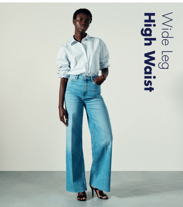
Wide Leg High Waist