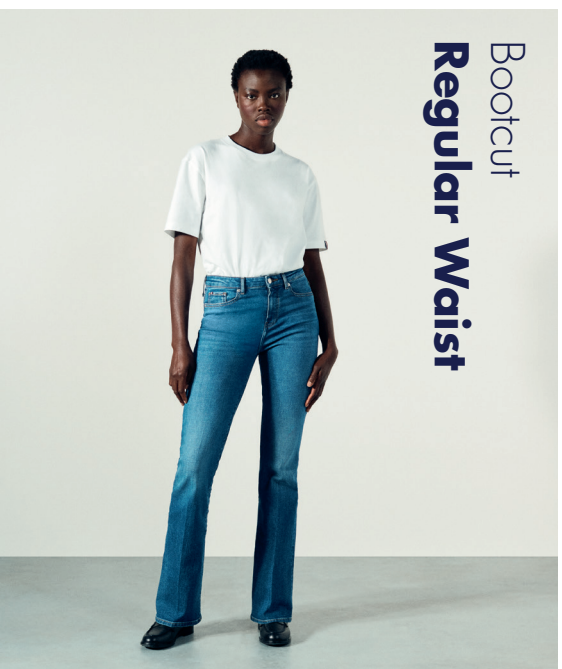
Bootcut Regular Waist