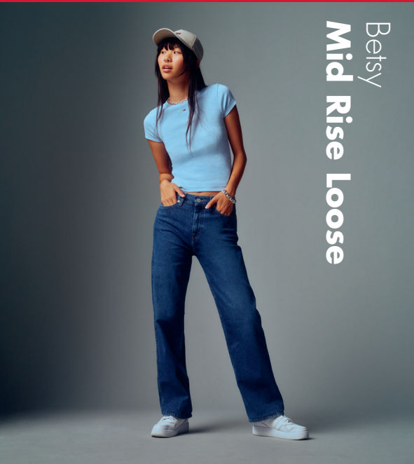
Betsy Mid Rise Loose