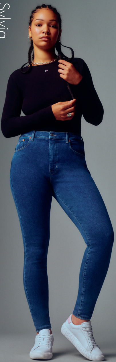
Sylvia High Rise Super Skinny