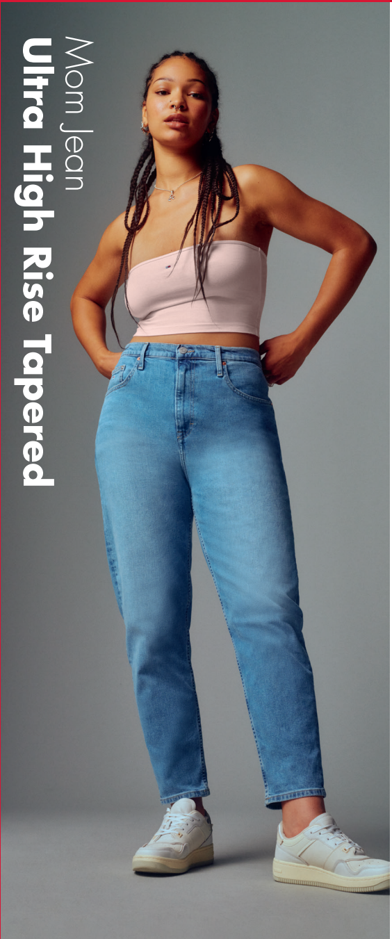
Mom Jean Ultra High Rise Tapered