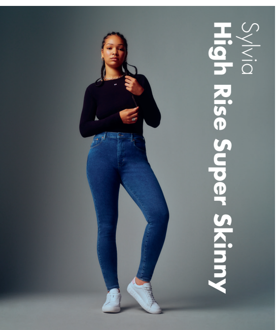
Sylvia High Rise Super Skinny