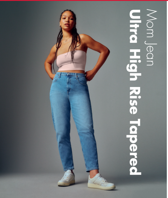
Mom Jean Ultra High Rise Tapered