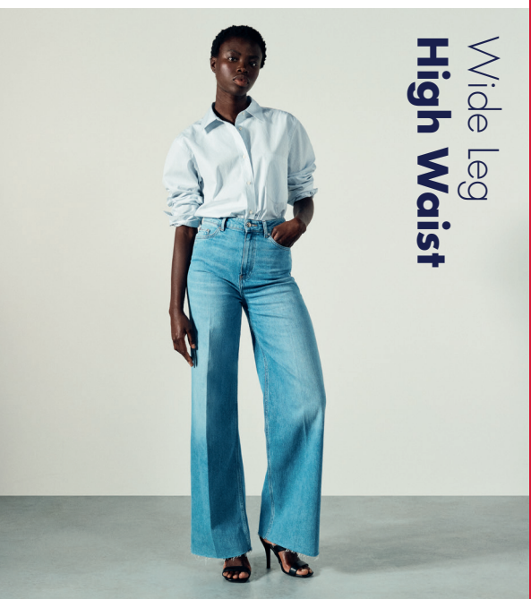
Wide leg High Waist