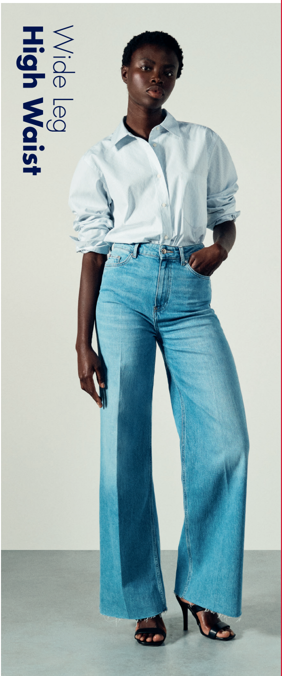
Wide Leg High Waist