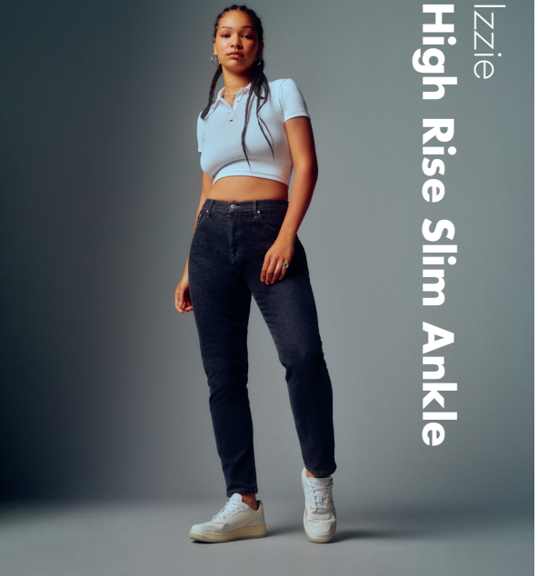
Lizzie High Rise Slim Ankle