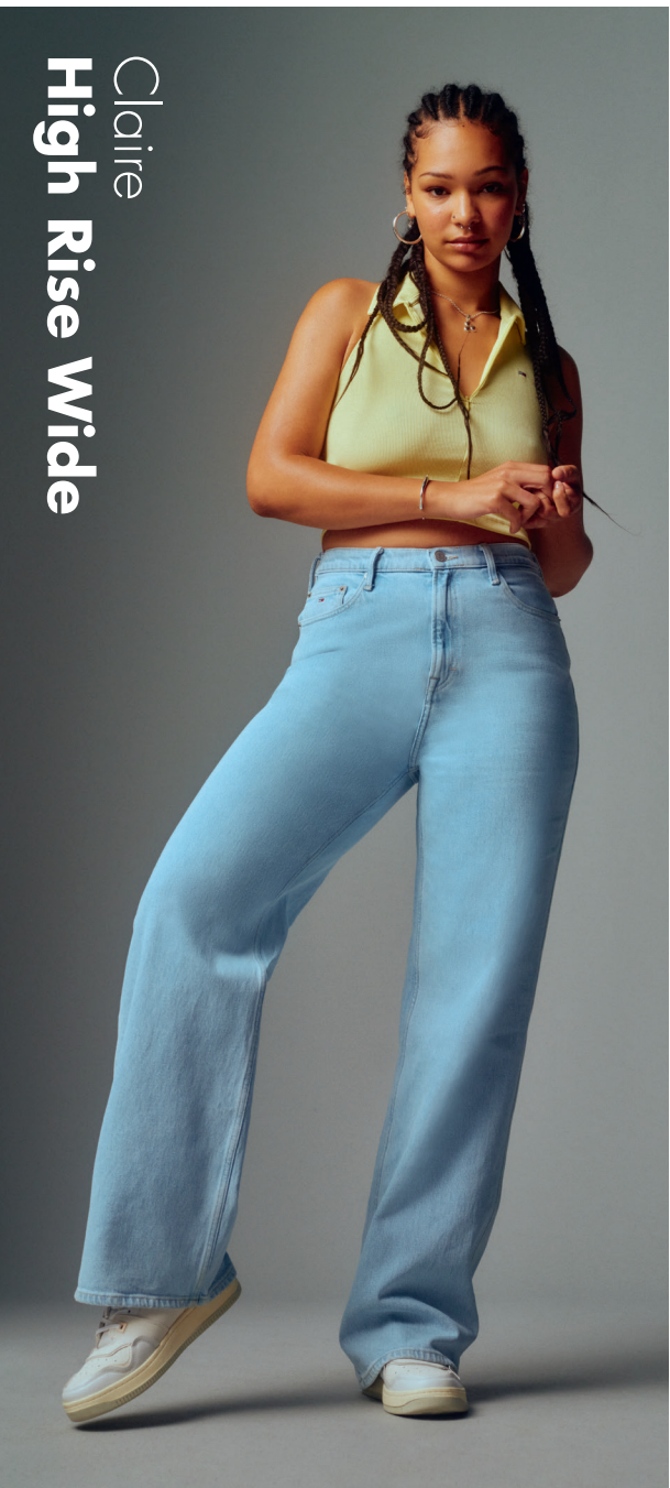
Claire High Rise Wide