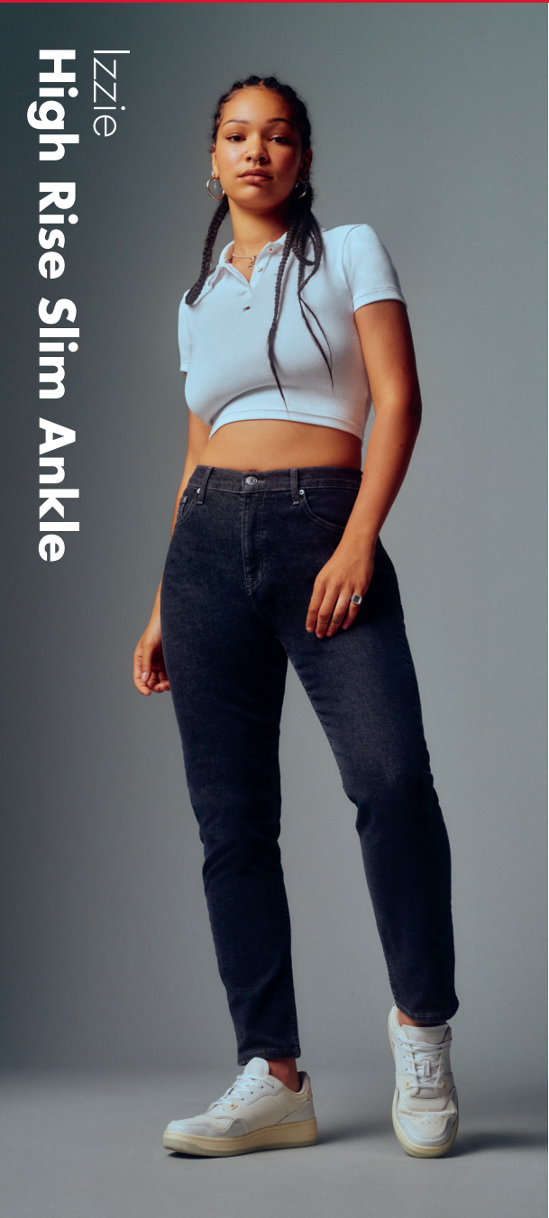
Lizzie High Rise Slim Ankle