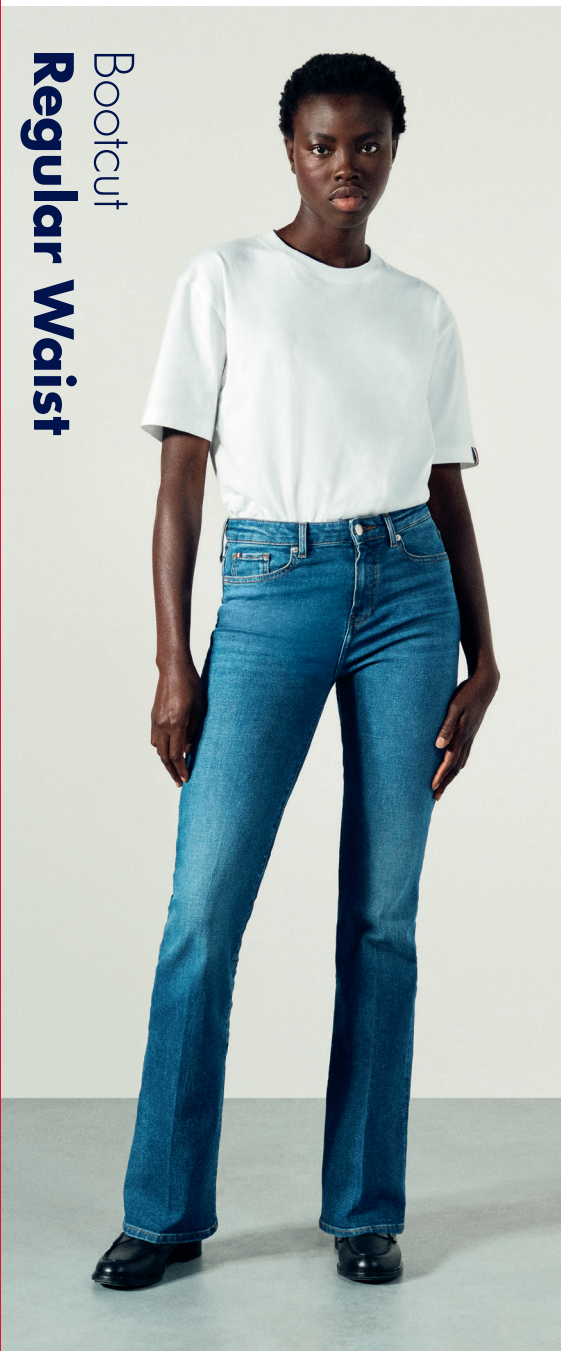
Bootcut Regular Waist