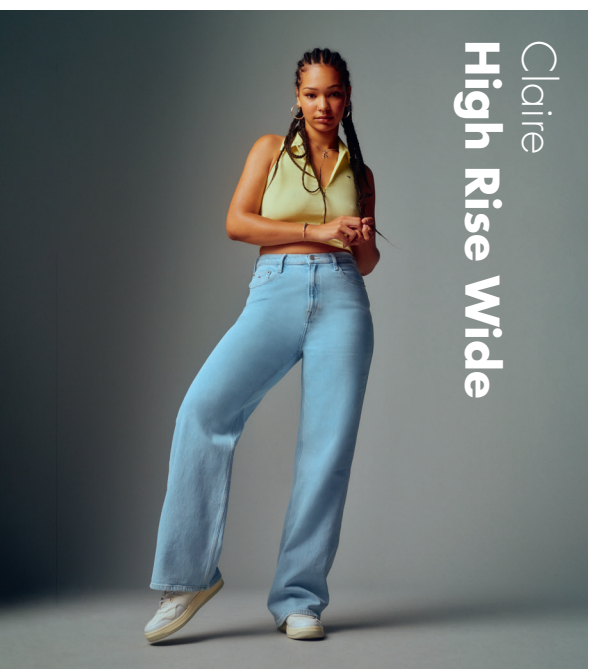
Claire High Rise Wide