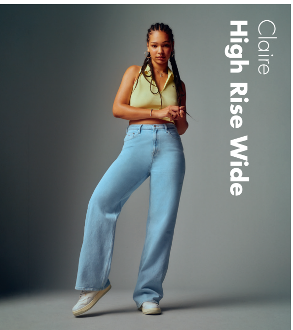
Claire High Rise Wide