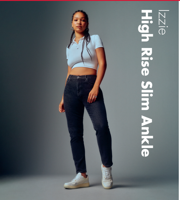
Lizzie High Rise Slim Ankle