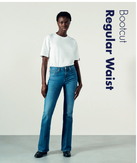
Bootcut Regular Waist